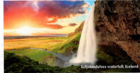
Seljalandsfoss waterfall, Iceland