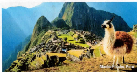
Machu Picchu, Peru

VOLENDAM | 68 PORTS | 28 COUNTRIES | 5 CONTINENTS | 8 OVERNIGHTS