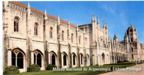
Museu Nacional de Arqueologia, Lisbon, Portugal