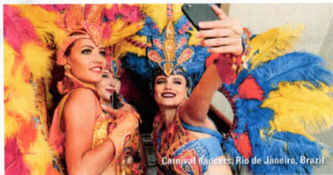
Carnival dancers, Rio de Janeiro, Brazil