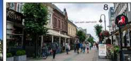
8 Marken's Gate/ Pedestrian Street

Many Museums in town temporarily closed.