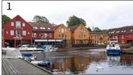
1 Fiskebrygga * Fish Market * Shops * Restaurants