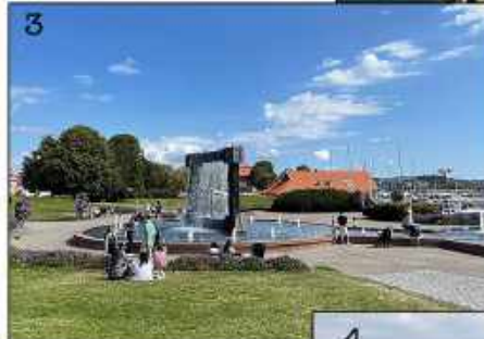
3 Boardwalk * Statues * Sculptures * Views