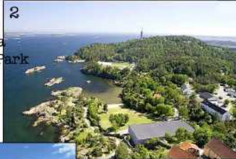
2 Odderøya Peninsula * Former Military area * Now a Recreational Park * TI has map