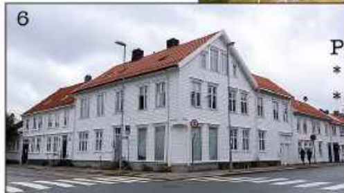
6 Posebyen * Oldest part of city * Interconnected wooden houses * 14 city Blocks