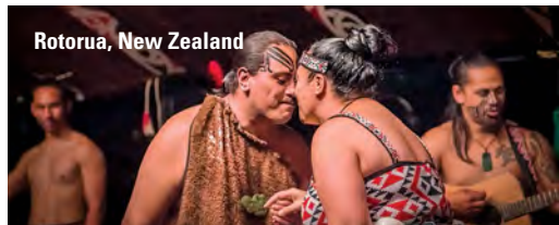
Rotorua, New Zealand

Our award-winning shore excursions are a perfect way to connect with people and places you'll visit on your Grand World Voyage. Wander the gardens of the Babylonstoren Wine Estate, visit a living Māori village or experience the thrill of the Tahune Airwalk 120 feet above the forest floor. Space is limited. Reserve your shore excursion today by calling an agent at 1-888-425-9376. See the full list of available shore excursions at www.hollandamerica.com .