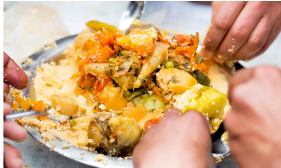
Couscous With Seven Vegetables