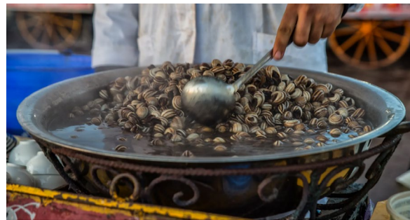
Snails in Spiced Broth