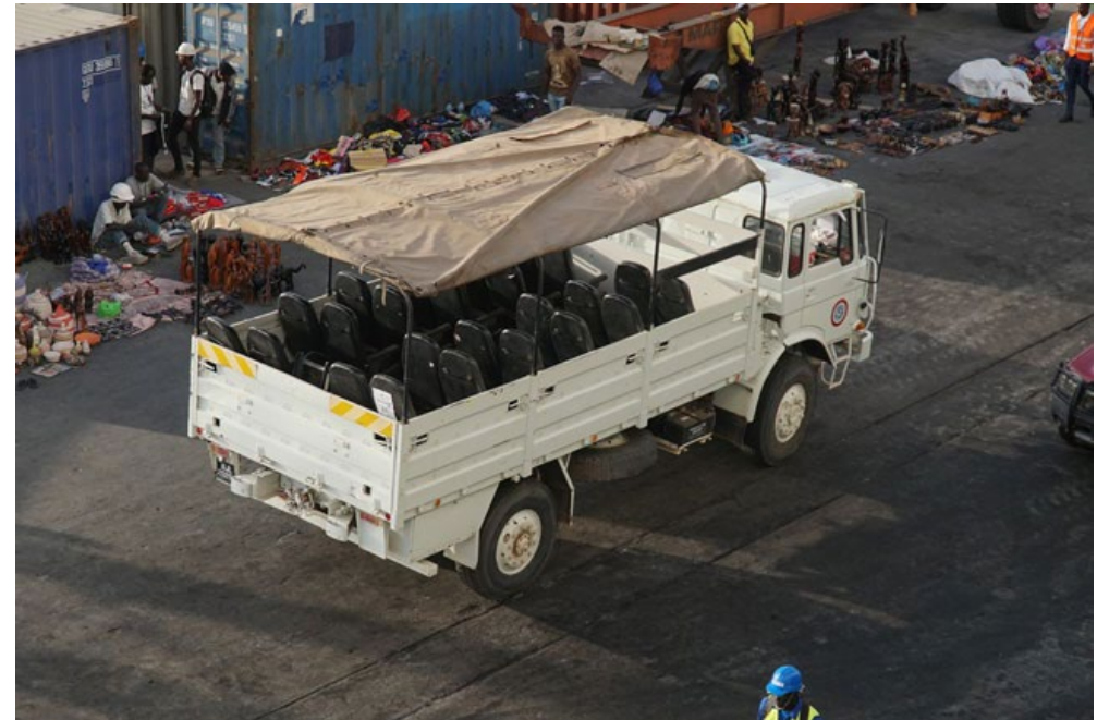
Off the Beaten Track Vehicle