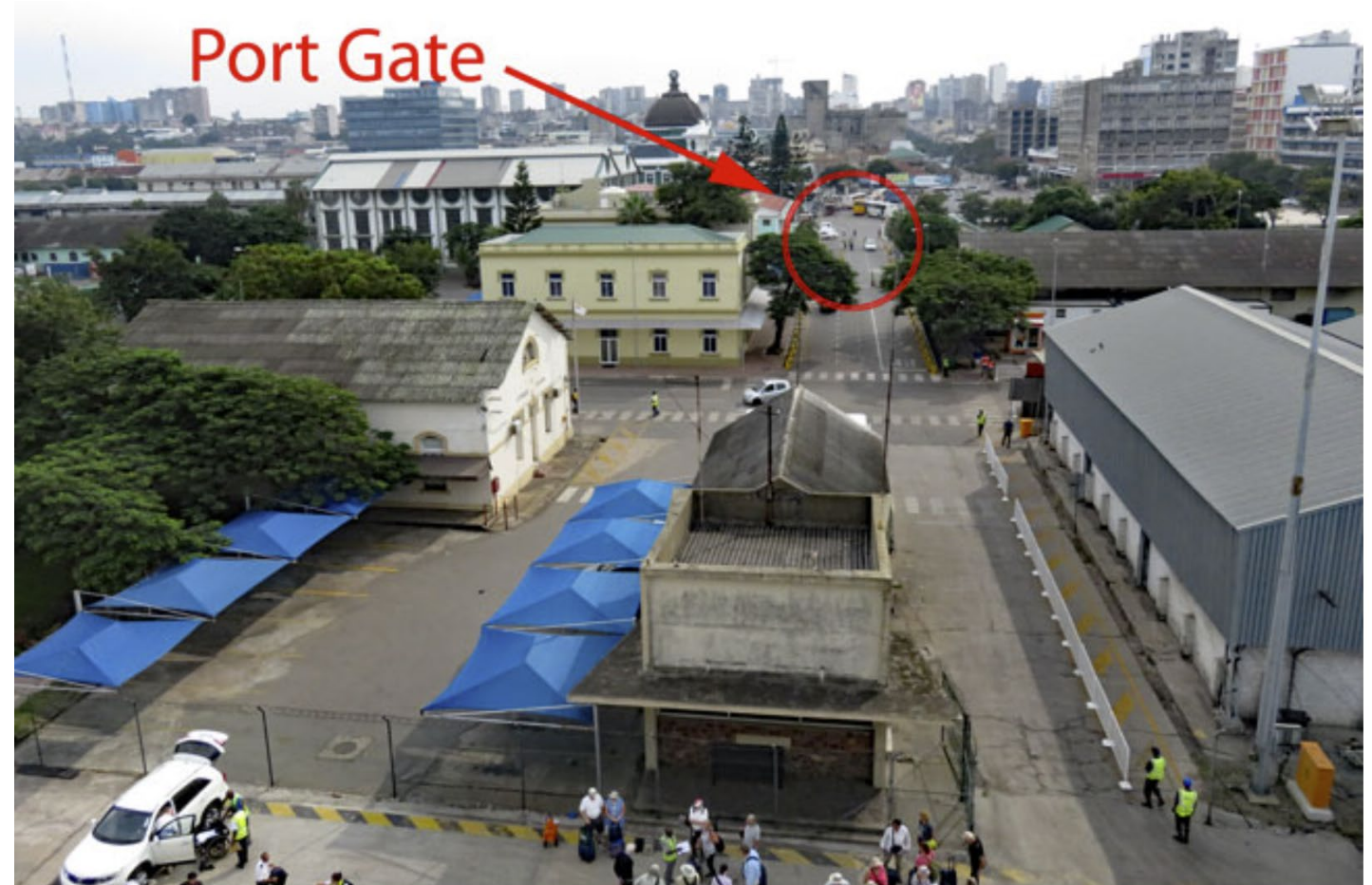
View of street leading to port gate from the ship. The train station is in the building with the dome in the background