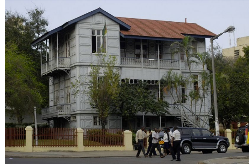
Casa De Ferro (Iron House)