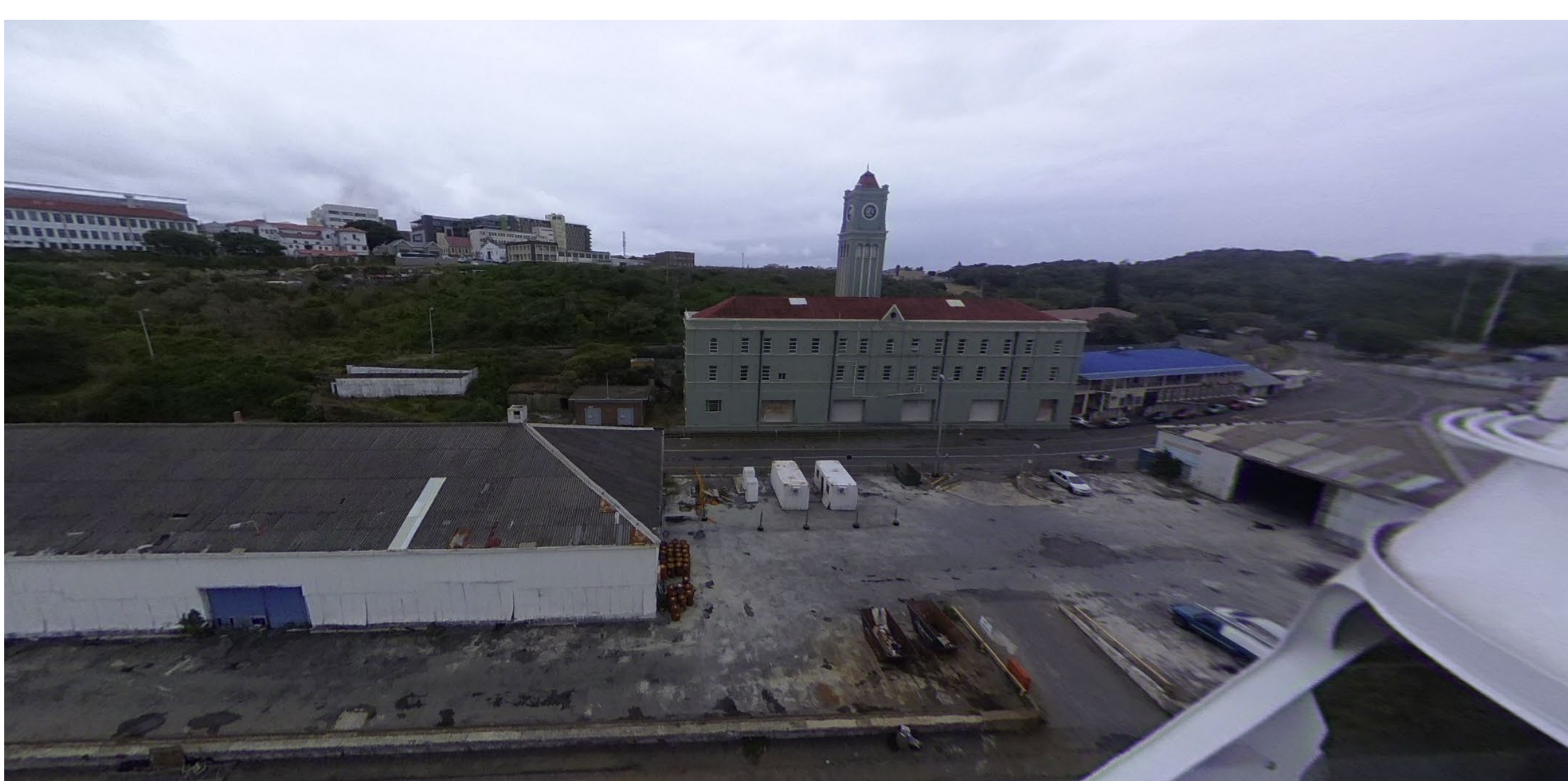
East London Port Area