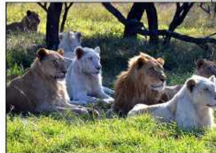
Phezulu Safari Park