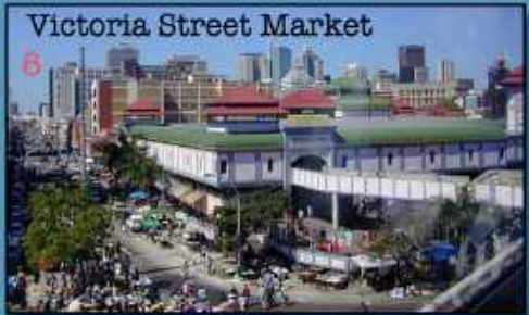
Victoria Street Market

Oldest Market Indian Quarter Afro Indian Blend City Loop Stop Guided Tours