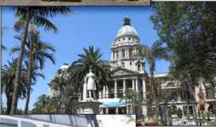
Natural Science Museum