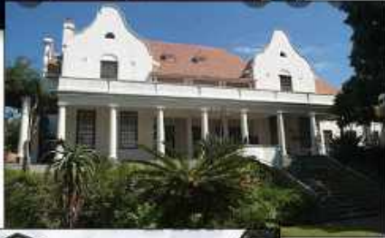
Killie Campbell Collection