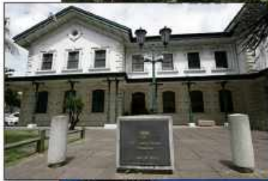
Old Courthouse Museum