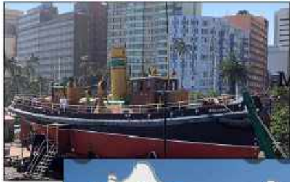
Port Natal Maritime Museum