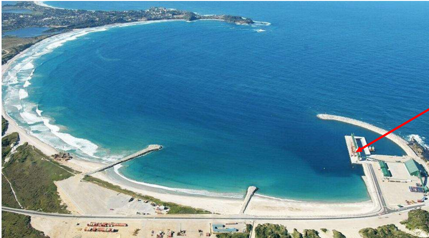
Cruise ship dock