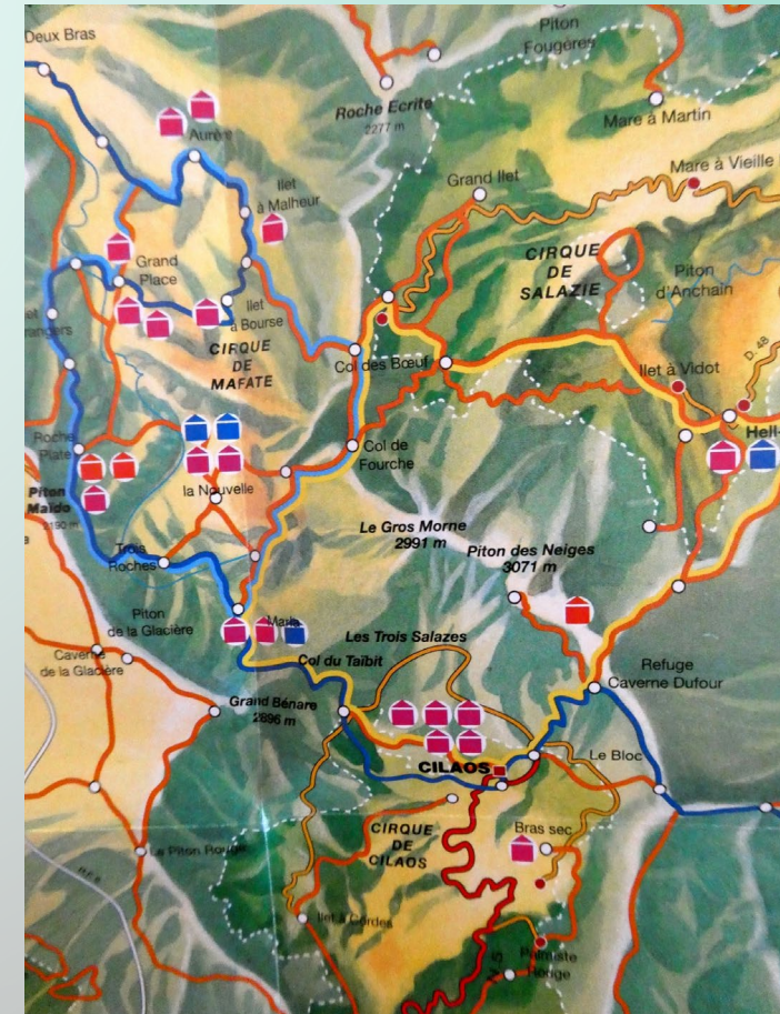
Map of three Reunion cirques