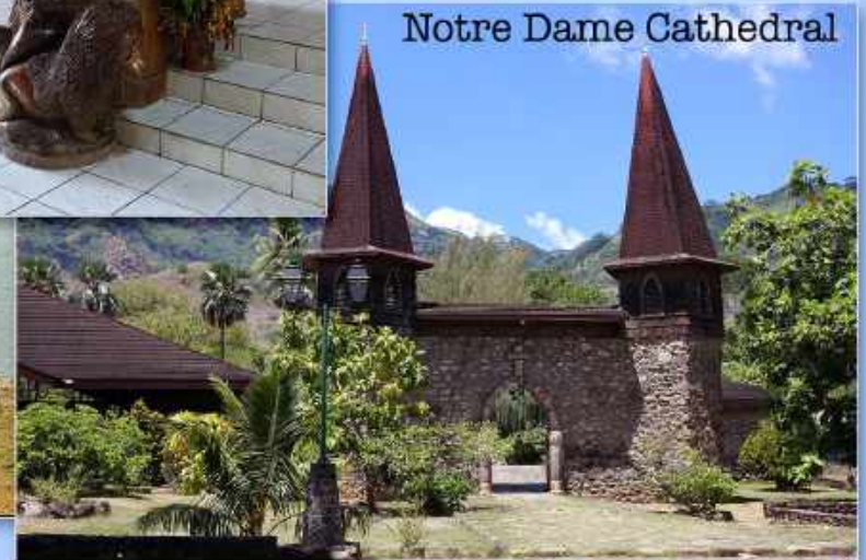
Notre Dame Cathedral

* Gate is part of wall from original 19th century building. Current church built in 1977