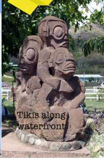
Tikis along waterfront

* Highest contemporary sculpture in the Pacific