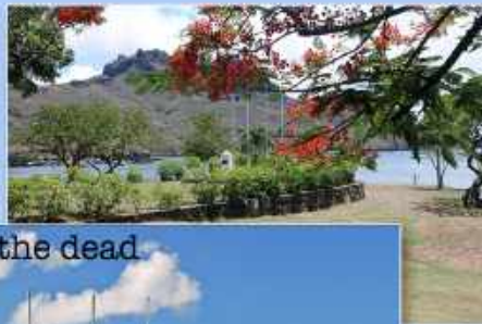
Monument to the dead

* Pulpit carved from single trunk of tamanu (ironwood)