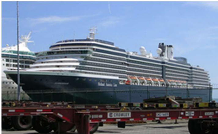
Zuiderdam docked in Limon