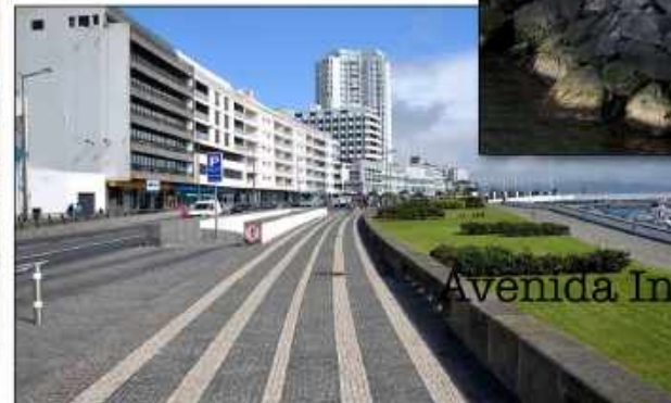
Avenida Infante D. Henrique