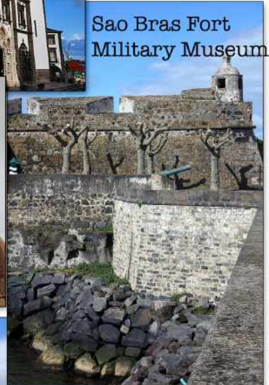
Sao Bras Fort Military Museum