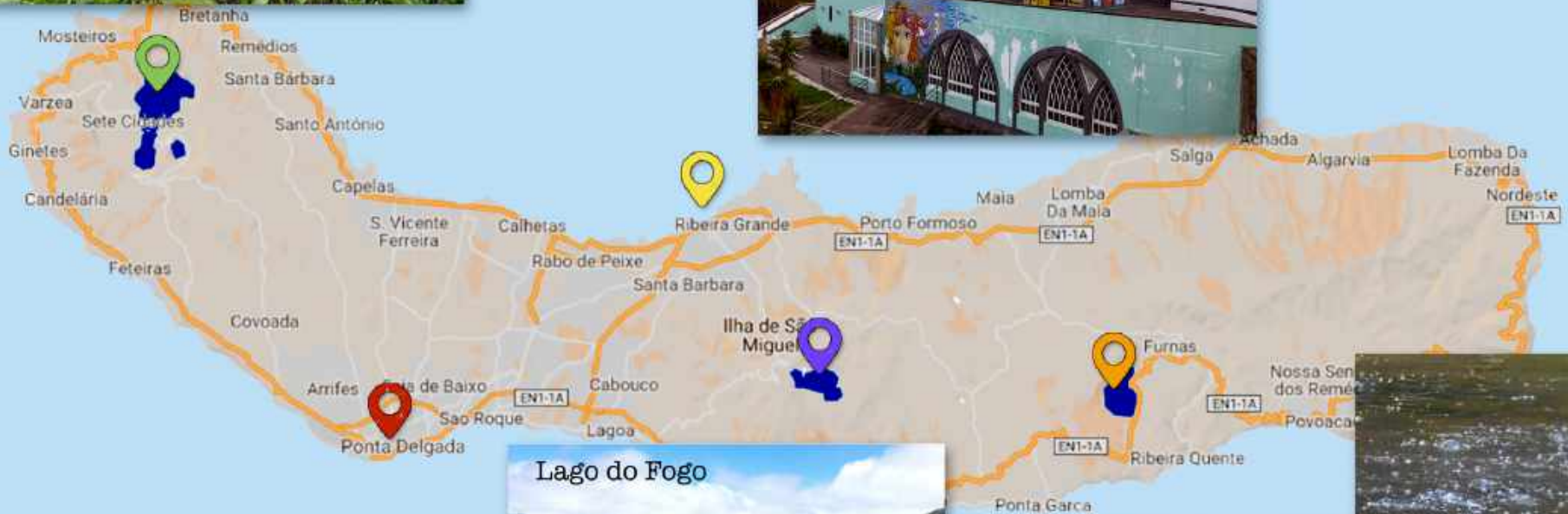
Lago do Fogo