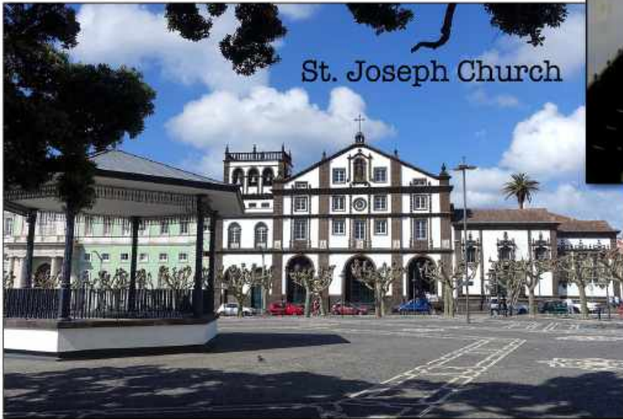
St. Joseph Church