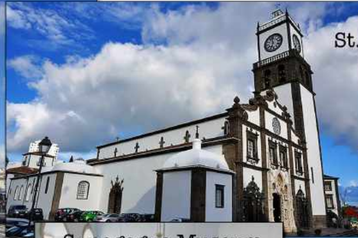
St. Sebastian Church