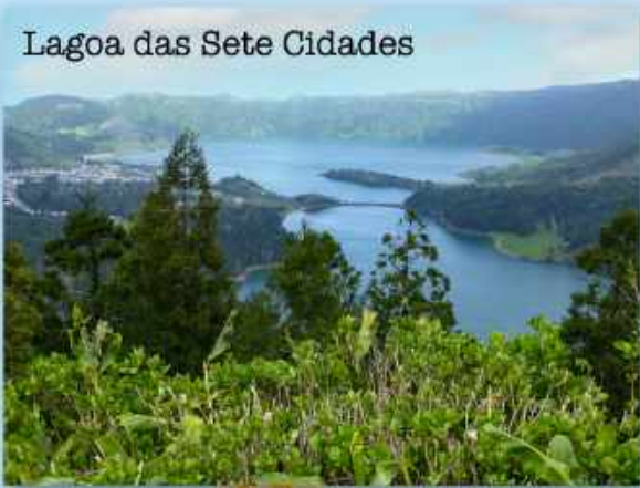
Lagoa das Sete Cidades