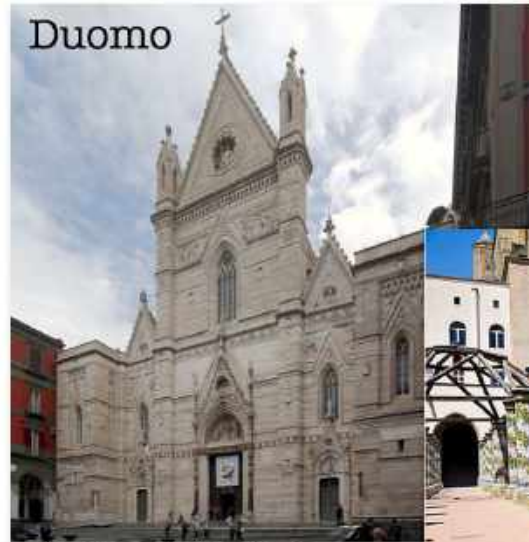
Naples Cathedral Seat of archbishop