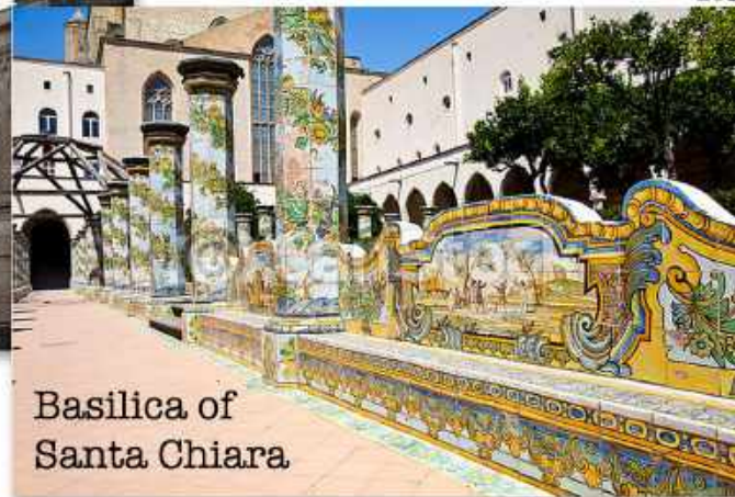
Basilica of Santa Chiara

Religious Complex Monastery Tombs Museum