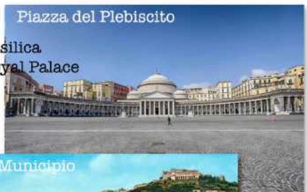
Piazza del Plebiscito