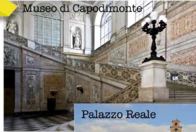
Museo di Capodimonte

National Gallery Baroque & Renaissance Art