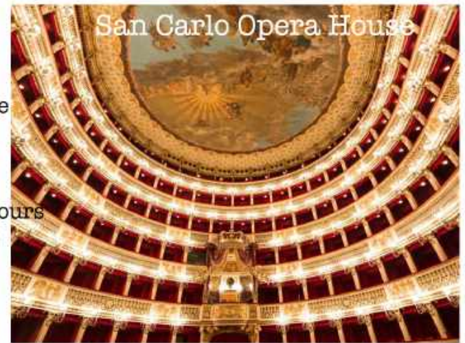
San Carlo Opera House