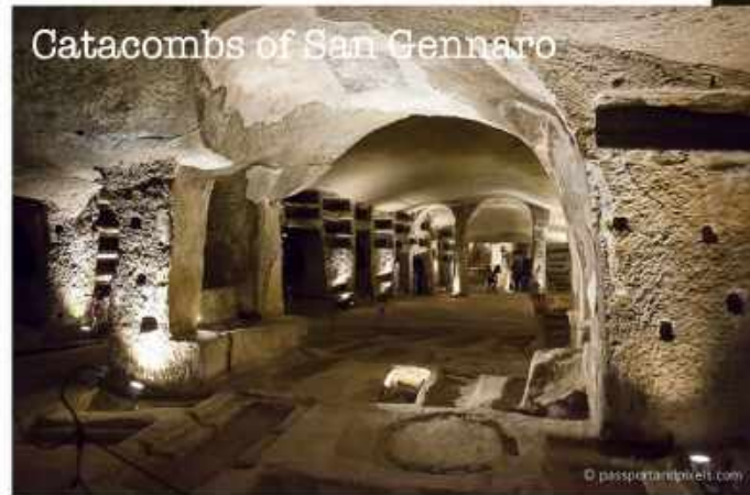
Catacombs of San Gennaro

Used beginning in 2nd or 3rd century as a pre Christian burial site