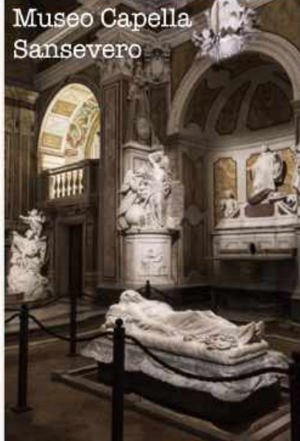
Sculpture of veiled Christ