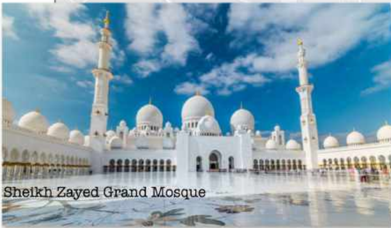
Sheikh Zayed Grand Mosque