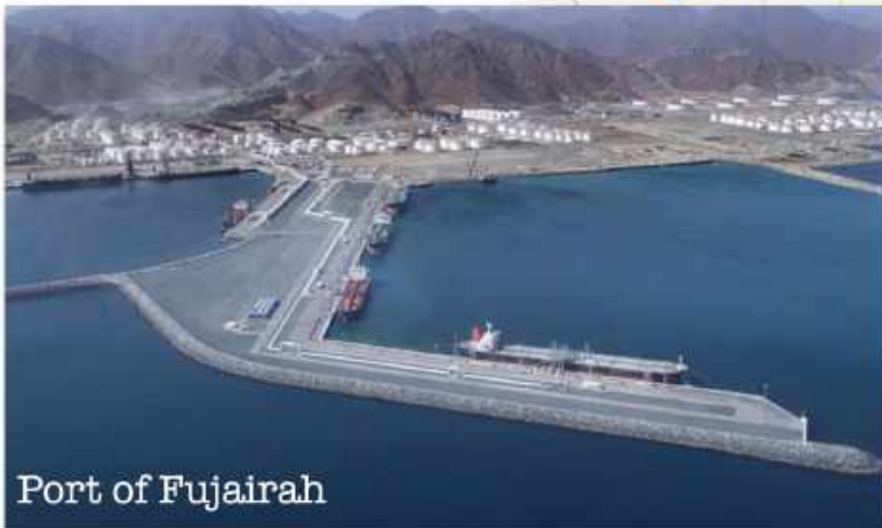
Port of Fujairah

Container & Oil Transfer port No terminal Free Shuttle to gate About 5 miles to town Taxi's available