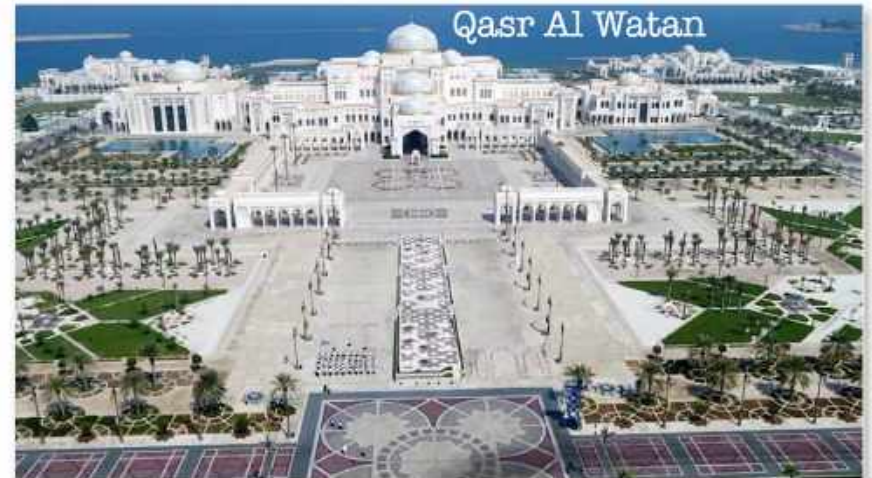
Qasr Al Watan