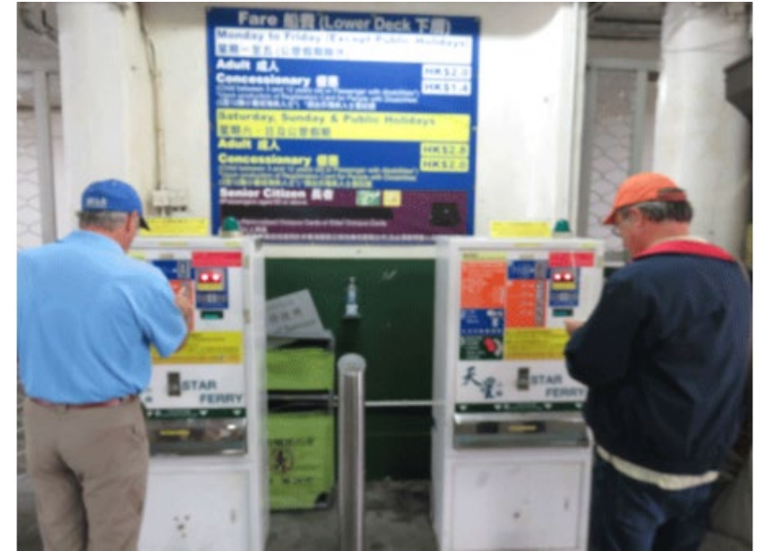
Buying Star Ferry Tokens