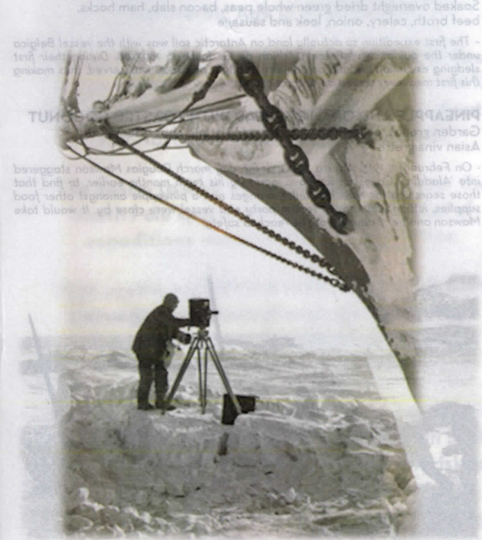
ERNEST SHAKLTON SETS UP FROM FRANK HURLEY ELEPHANT ISLAND IN THE JAMES CAIRD