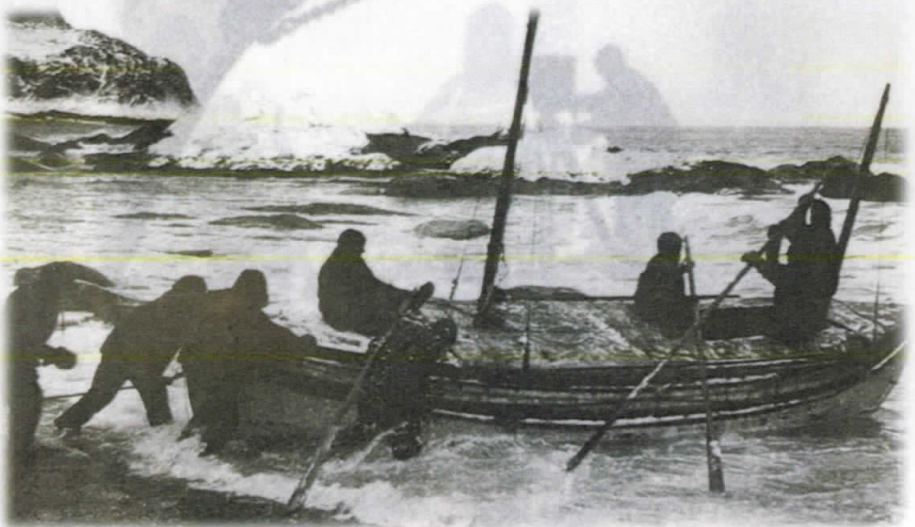
ERNEST SHACKLETON SETS OFF FROM ELEPHANT ISLAND IN THE JAMES CAIRD