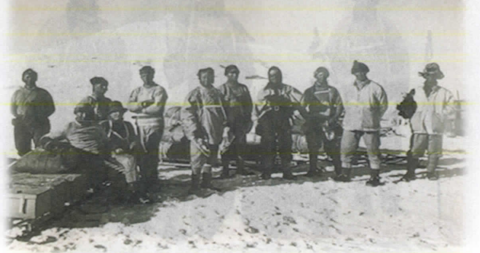
SCOTT'S 'SOUTHERN DEPOT PARTY'

- As the Australian Antarctic Expedition left Hobart on December 2, 1911, the vessel Aurora was overloaded and a second vessel, the Taroa was hired to carry the overload of supplies, which included 55 live sheep which were used for mutton.