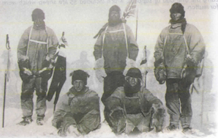
ROBERT FALCON SCOTT AT THE SOUTH POLE