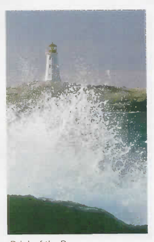
Drink of the Day: Canadian Sydney Breeze AVAILABLE IN ALL BARS Rye, Crème de Banane, Raspberry purée, house sour and soda water $6.50